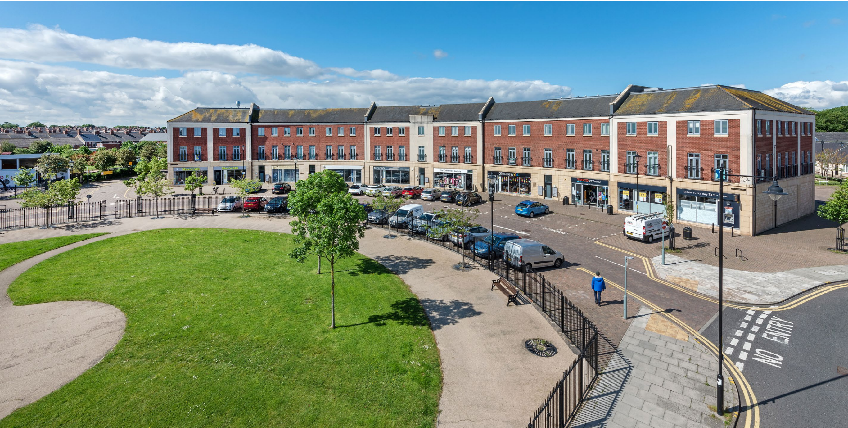
WESTOE CROWN VILLAGE RETAIL CENTRE SOUTH SHIELDS NE33 3GE